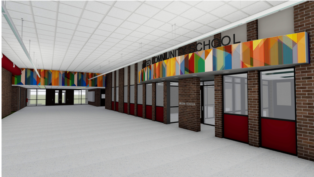
COMMONS PERSPECTIVE LOOKING SOUTH